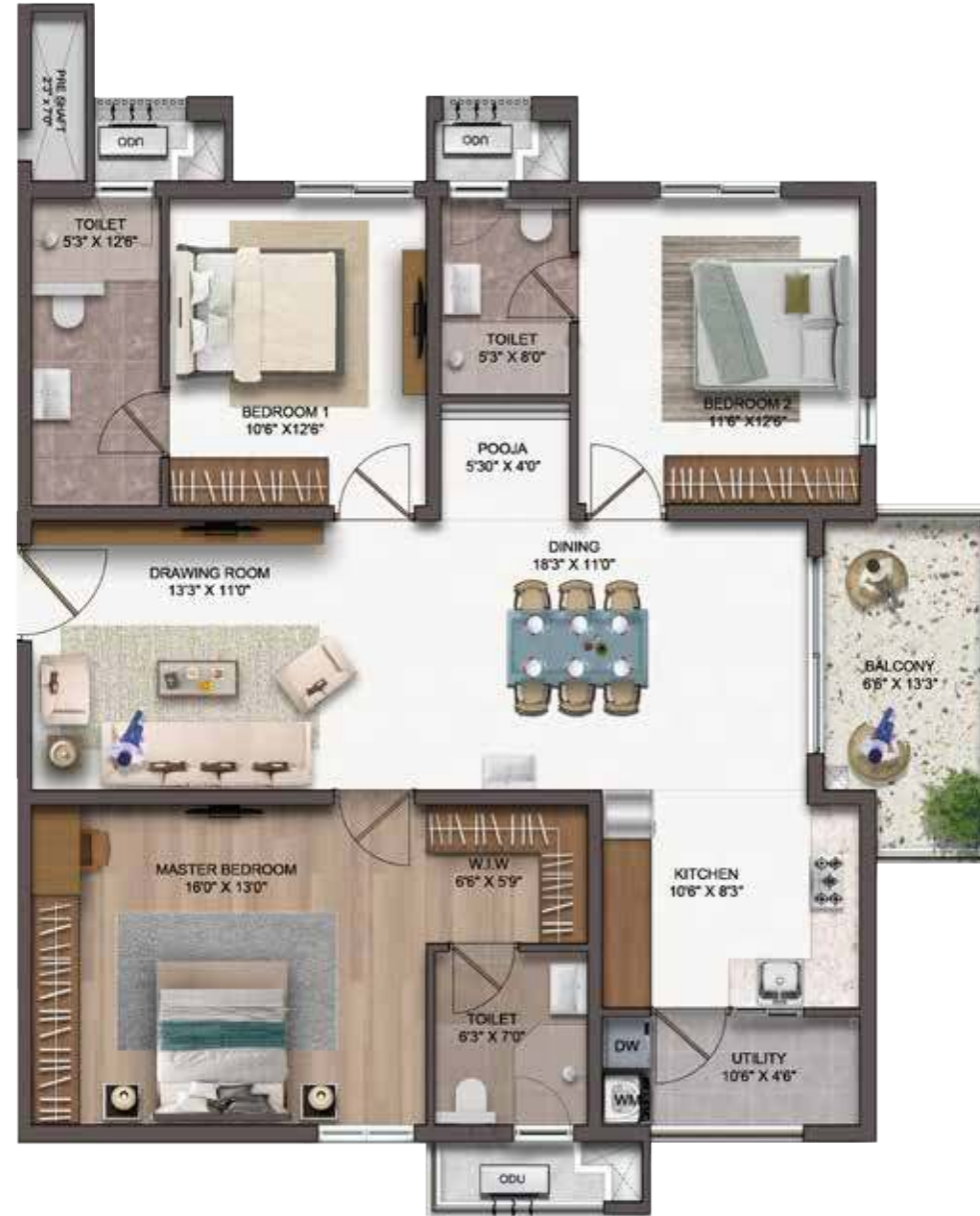
3 BHK West - 1870 SFT