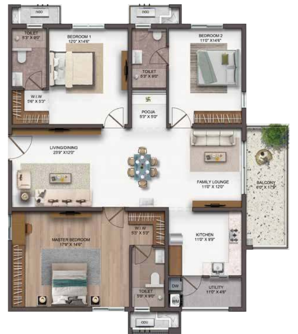
3 BHK West - 2200 SFT