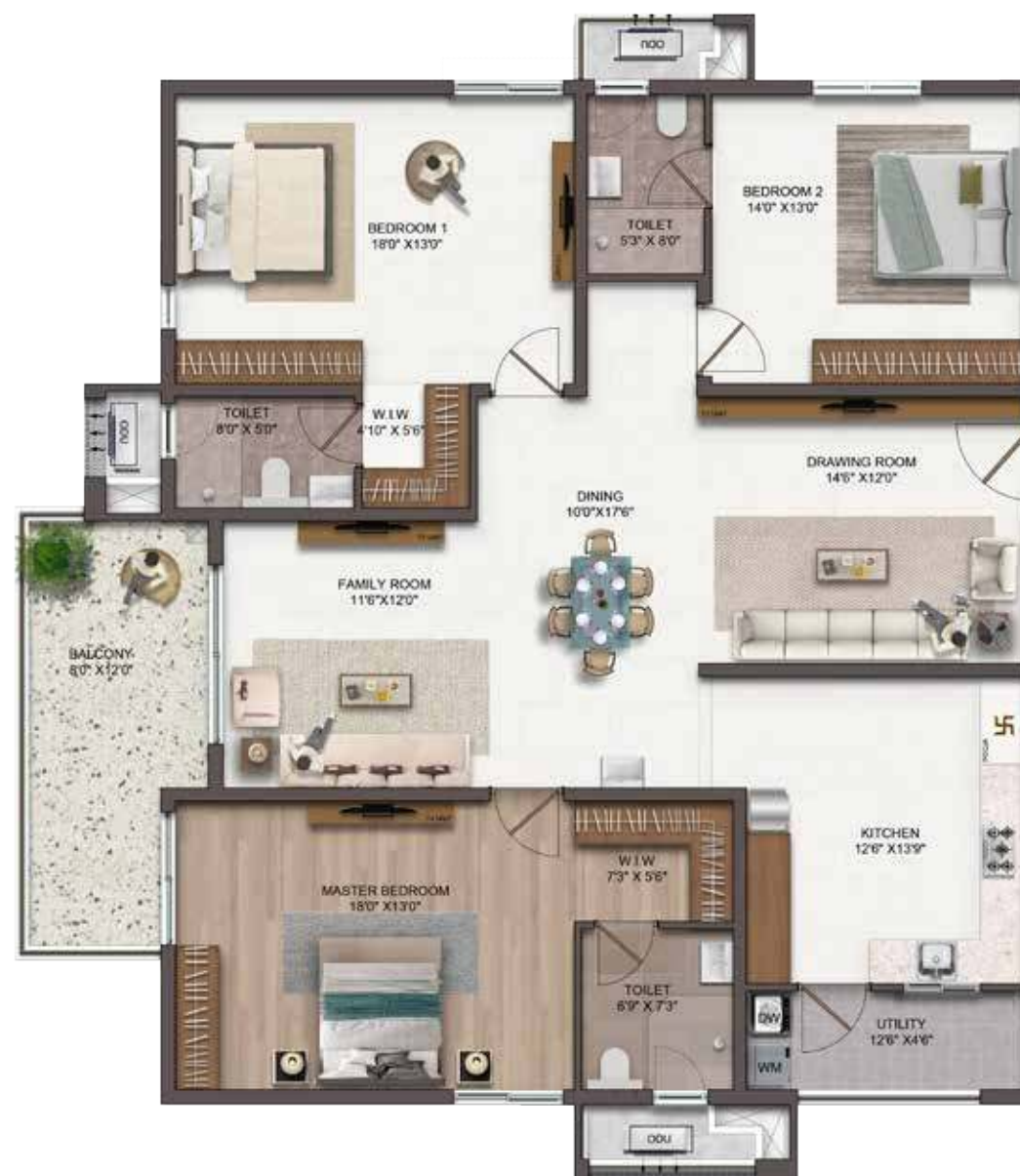
04 3 BHK East - 2525 SFT