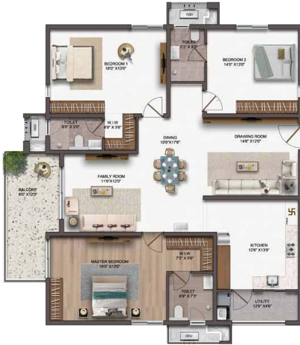
3 BHK East - 2525 SFT