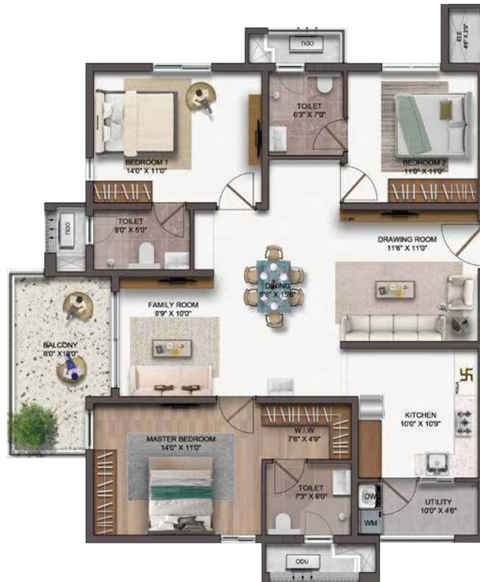
3 BHK East - 1870 SFT