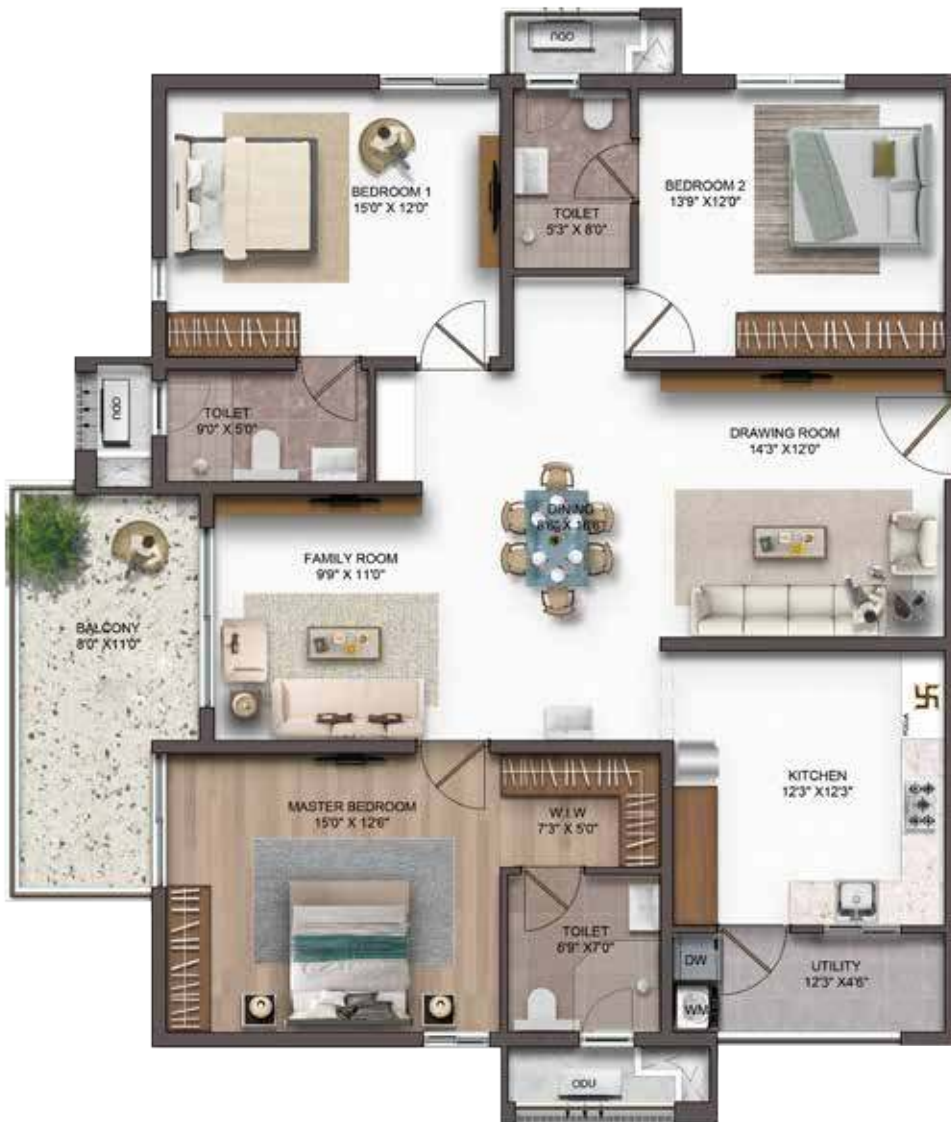
3 BHK East - 2200 SFT