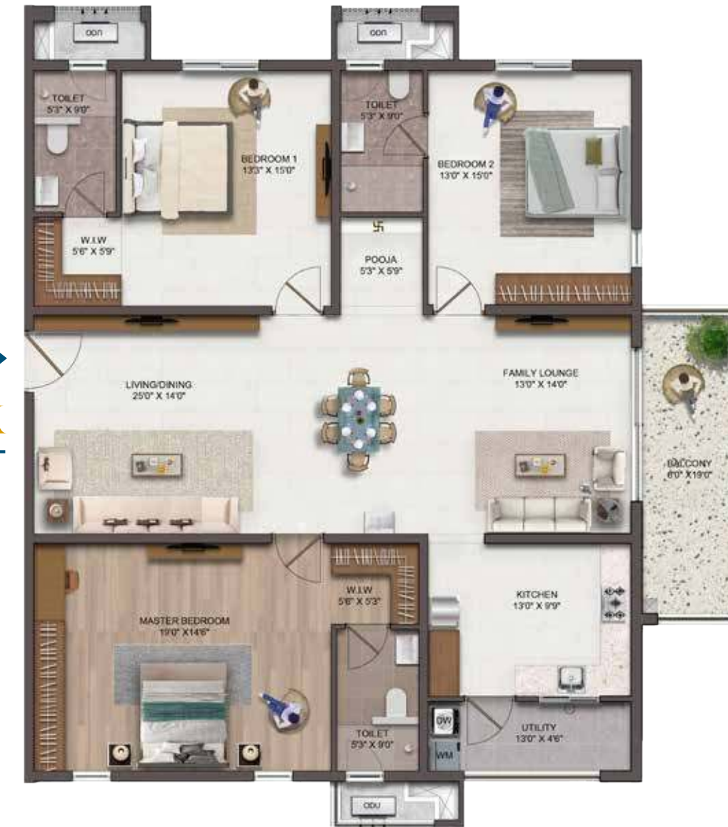
02 3 BHK West - 2525 SFT