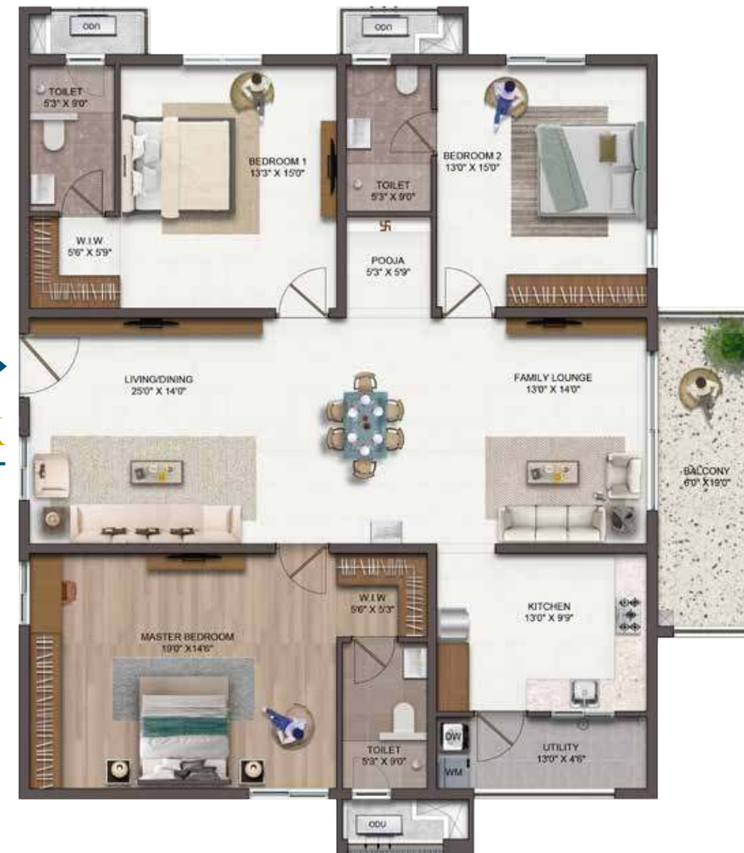
03 3 BHK West - 2525 SFT