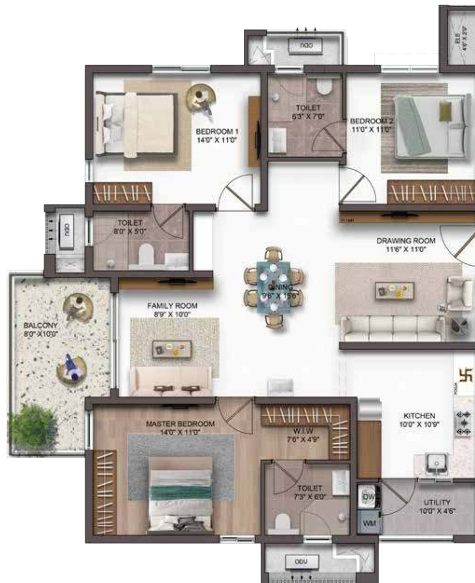
3 BHK East - 1870 SFT