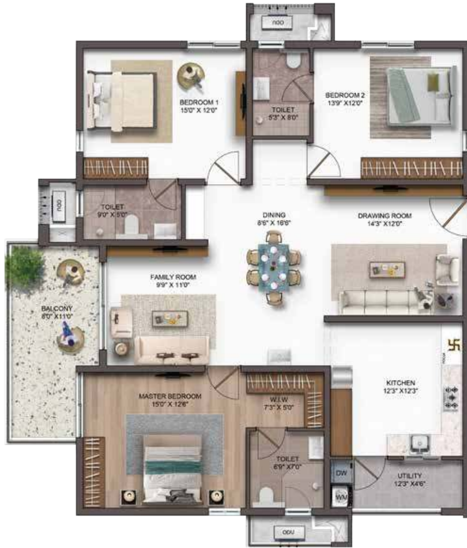
3 BHK East - 2200 SFT