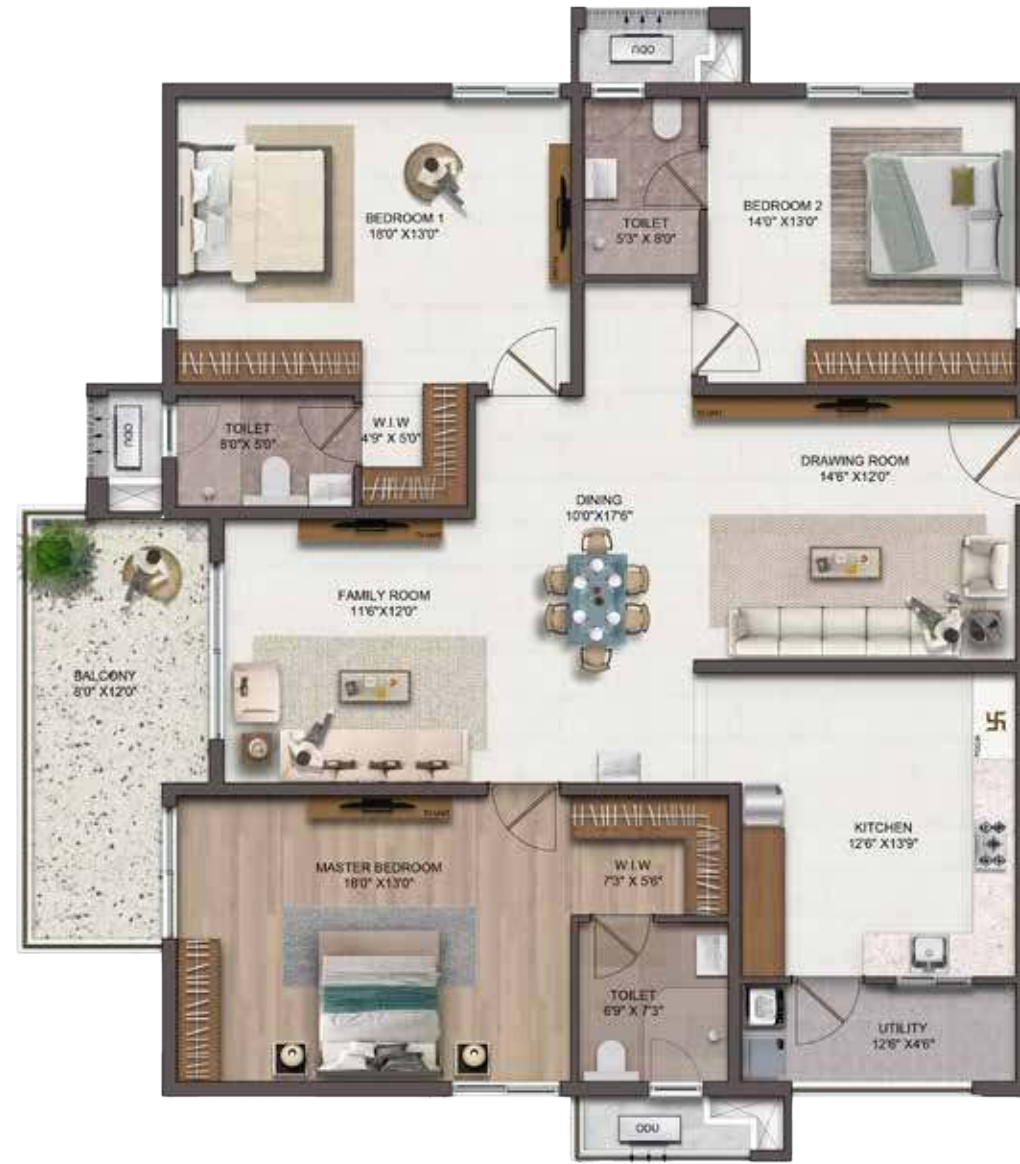
01 3 BHK East - 2525 SFT