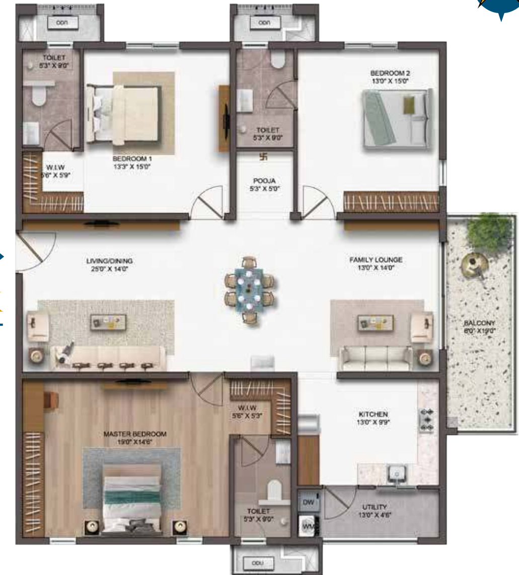
3 BHK West - 2525 SFT