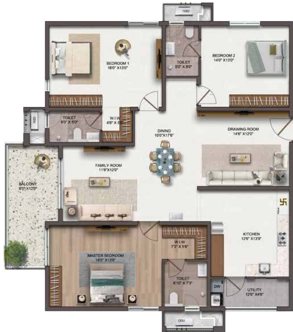
3 BHK East - 2525 SFT